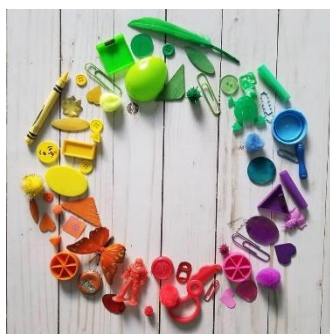
At home colour wheel example

Please refer to the marking criteria attached.