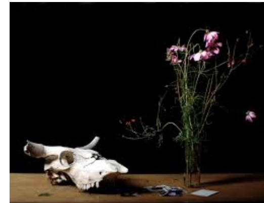
Examples of modern-day Vanitas Photography

This task is part of your formal assessment in this subject. Tasks not submitted on the due date will be given a zero mark and may affect the may affect the successful completion of this course. If you are sick on the due date you will have to provide a medical certificate to support your appeal. A medical certificate will need to be presented to Ms Rydstrand or your teacher on the morning of the first day you are back at school.