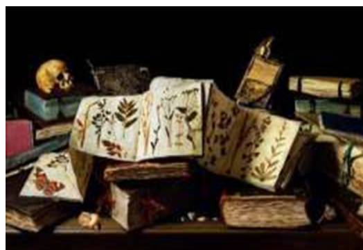
Robyn Stacey "Leidenmaster 1" 2003 From The Collector's Nature. Type C Print 96 x 150 cm Stills Gallery Sydney