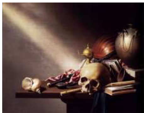
Harmen Steenwyck "Still Life: An Allegory of the Vanities of Human Life" 1640 Oil on Oak 39.2 x 50.7cm National Gallery London

Submit you best 3 images for marking. Submission must upload onto Google Classroom.