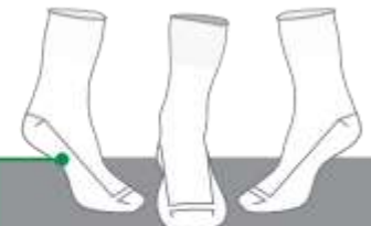
ANKLE SOCKS - WHITE #97978