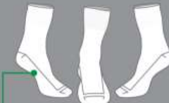
ANKLE SOCKS - WHITE #97978