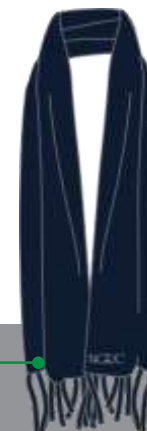
SCARF - NAVY BODY - W/ EMB # 71226