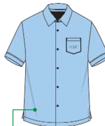
JUNIOR BOYS DELUXE OVER SHIRT - SKY BODY (NEW FABRIC) - W/ EMB ON POCKET