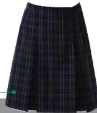
JUNIOR GIRLS SKIRT 2 BOX PLEATS #91857