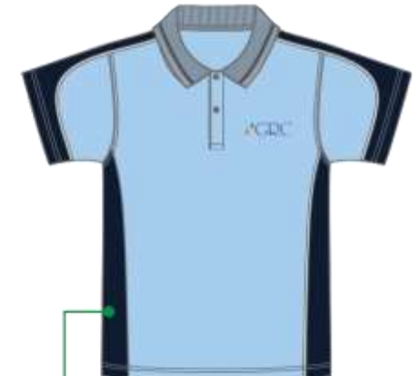
UNISEX SPORTS POLO - W/ EMB # 85053