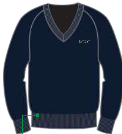
PULLOVER - NAVY BODY - W/ EMB # 59295