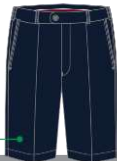
JUNIOR BOYS SHORTS - NAVY BODY