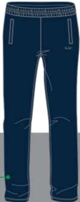
UNISEX TRACK PANTS - NAVY BODY - W/ EMB