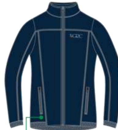
GIRLS SOFT SHELL - W/ EMB