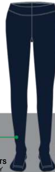
TIGHTS -NAVY #86260