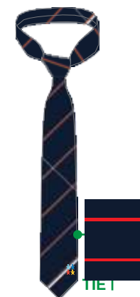
TIE - GOLD/RED/BLUE STRIPES - W/ EMB #77325