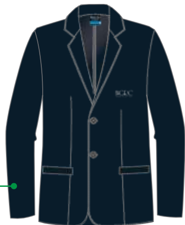
JUNIOR BOYS BLAZER - W/ EMB # 98446