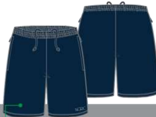
UNISEX SPORTS SHORTS - W/ SKY PIPING - STRETCH MICROFIBRE - W/ EMB