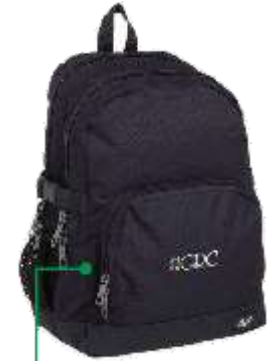
BACKPACK - NAVY BODY - W/ SCREEN PRINT