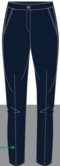
JUNIOR GIRLS PANTS