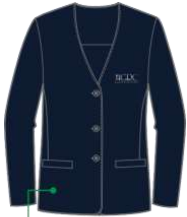
JUNIOR GIRLS BLAZER - W/ EMB