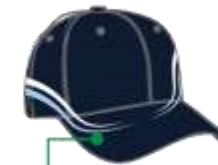
CAP - NAVY BODY - W/ WHITE & SKY STRIPE # 73120