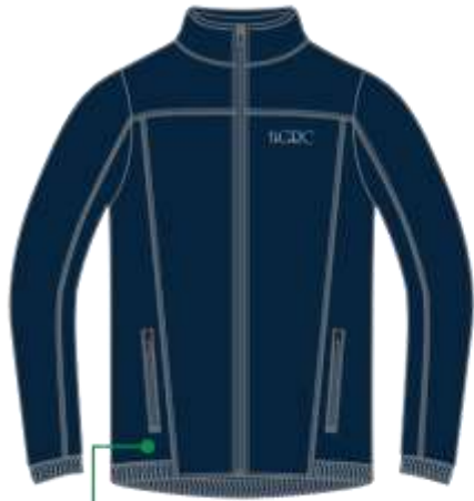
BOYS SOFT SHELL - W/ EMB