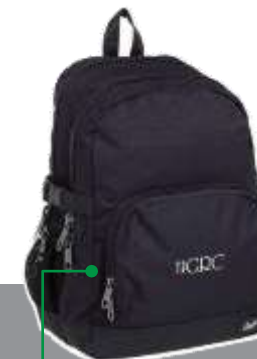
BACKPACK - NAVY BODY - W/ SCREEN PRINT