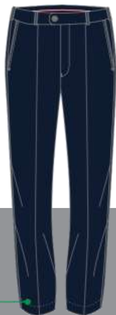
JUNIOR BOYS PANTS - NAVY BODY