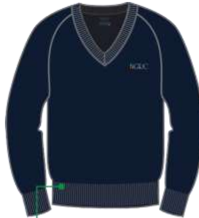
ALL YEARS PULLOVER - NAVY BODY - W/ EMB # 59295