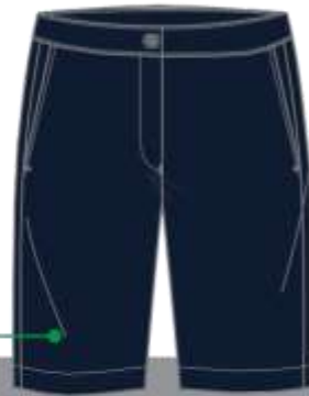
JUNIOR GIRLS SHORTS